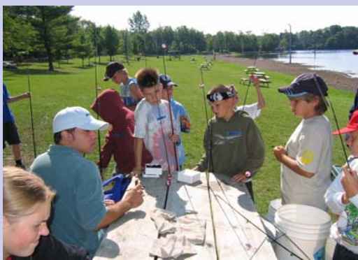
Fishing Pros will help kids get hooked through providing quality education and information.