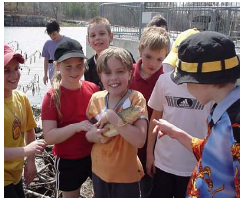
Kids will learn more about fish and their habitat at this fun fishing event at Belwood Lake Conservation Area.

When you register you will be asked which stations you wish to visit (select 6). They will be filled on a first come first served basis.